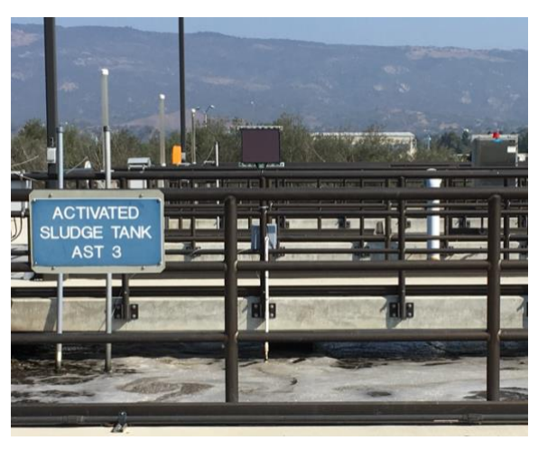
Figure 1 – Activated Sludge Monitoring Installation in Goleta, CA

The MiProbE directly reports microbial response to the aerobic or anaerobic conditions, rather than the dissolved oxygen or oxygen reduction potential changes in the environment. The MiProbE requires no regular maintenance or cleaning – the biofilm is the active surface for the sensor probe.